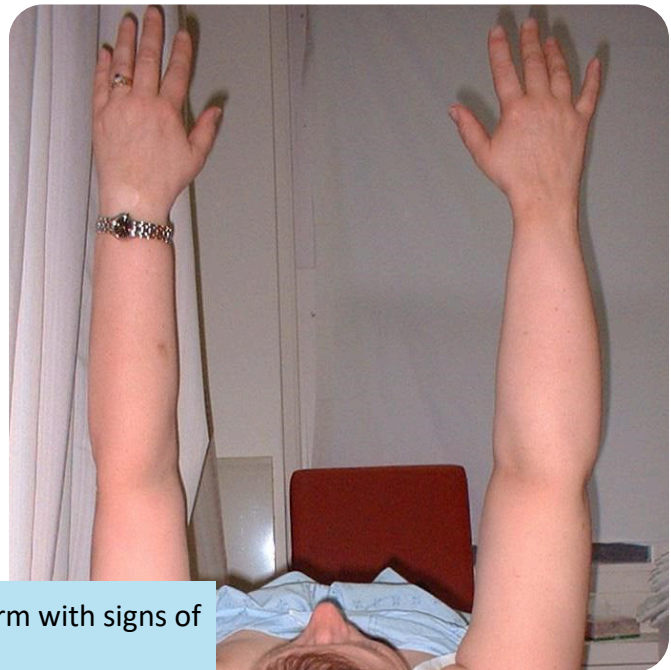
Image showing the right arm with signs of lymphedema.