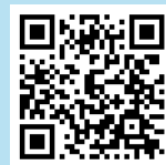
Ontario Health atHome