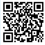
Lymphedema Association of Ontario

You can also scan the QR Code or click the blue links below to learn more online.