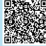
Lymphatic Self Massage

Lymphedema Association of Ontario: lymphontario.ca